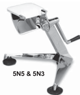
5N5 & 5N3